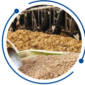
ANIMAL FEED INDUSTRIES